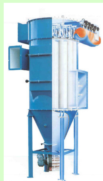
Sanovo dust filter