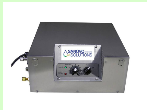
Sanovo Solutions Ozone Treatment